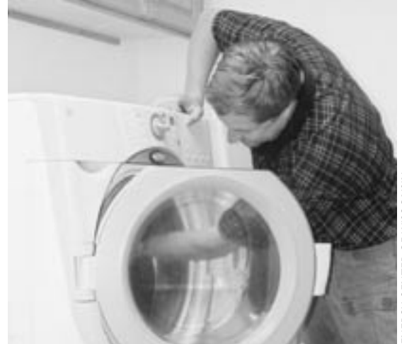
ENERGY CENTER OF WISCONSIN

If you wash ten loads of laundry a week, you will save more than 100,000 gallons of water over the 15-year life of the washing machine.